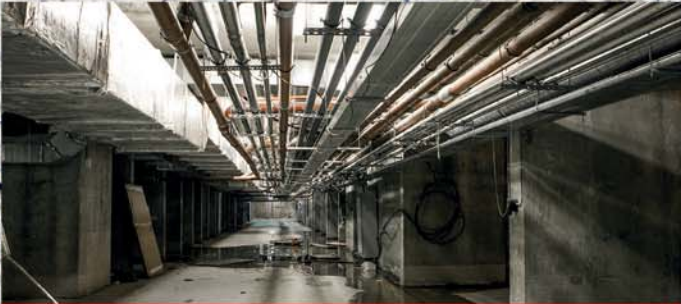
SUSPENDED CEILING APPLICATIONS